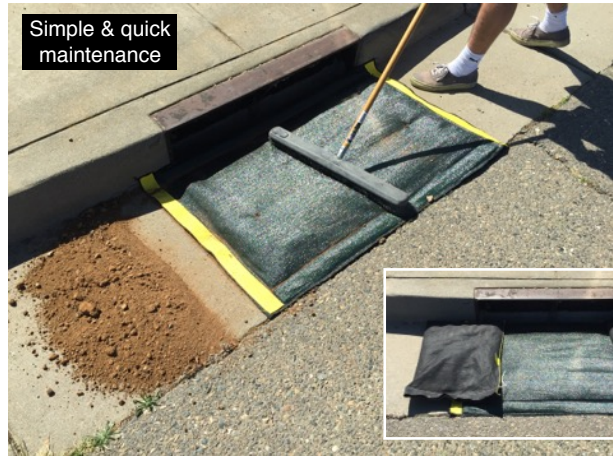
Simple & quick maintenance

The AGG 2 Filter is useful in drain inlet protection when an under-grate filter, such as the YellowJacket or Hornet's Nest filter, is not feasible. Ideal for combo drain inlets and surface only drain inlets. Built into each unit is an overflow portal to allow faster flow-thru during heavy storm events. The AGG 2 Filter can either be held in place with gravel bags or the preferred method of attaching unit to the grate with heavy duty wire.