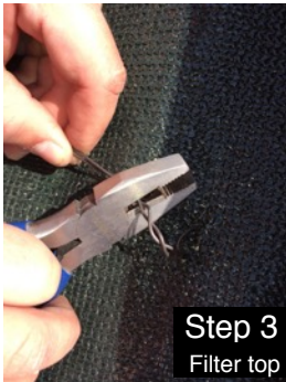
Step 3 Filter top Twist wire and cut.