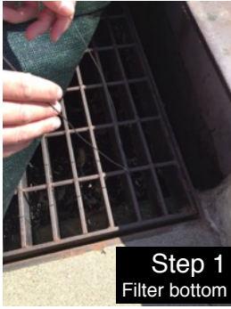
Step 1 Filter bottom Attach wire to grate.